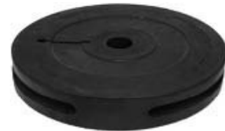
DUAL SOLID - PIPE WIPER