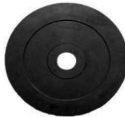
SINGLE - PIPE WIPER