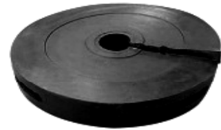
DUAL SPLIT - PIPE WIPER